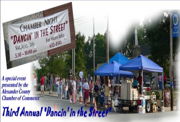
A special event presented by the Alexander County Chamber of Commerce